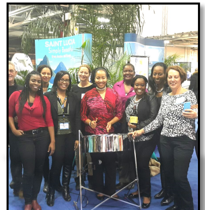
2016 Boat Show, Dusseldorf, Germany