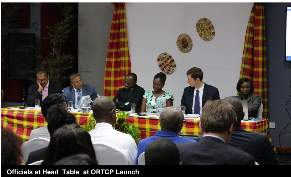
Officials at Head Table at ORTCP Launch