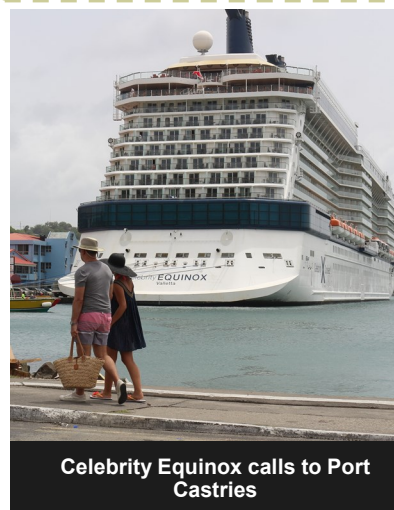
Celebrity Equinox calls to Port Castries

He expressed confidence that with the upgrades to Castries to be delivered under the project, there is potential for the city to become "a signature destination" that can attract more of cruise visitors or yachting tourists to the island.