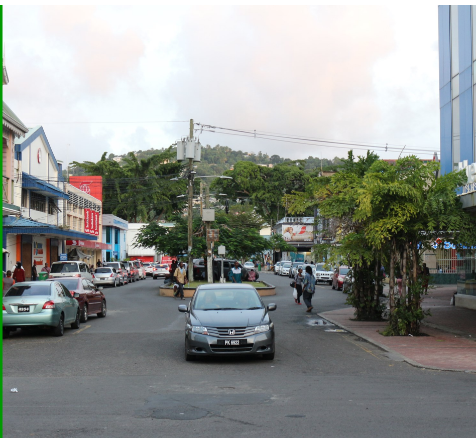
Castries Boulevard - a hub for commerce

The William Peter Boulevard, a major commercial hub in the city is also earmarked to be enhanced as a hot spot for tourists to 'chill' and immerse in the Saint Lucia way of life, enjoying an ambiance enriched with cafes and urban furniture and occasionally, live entertainment."