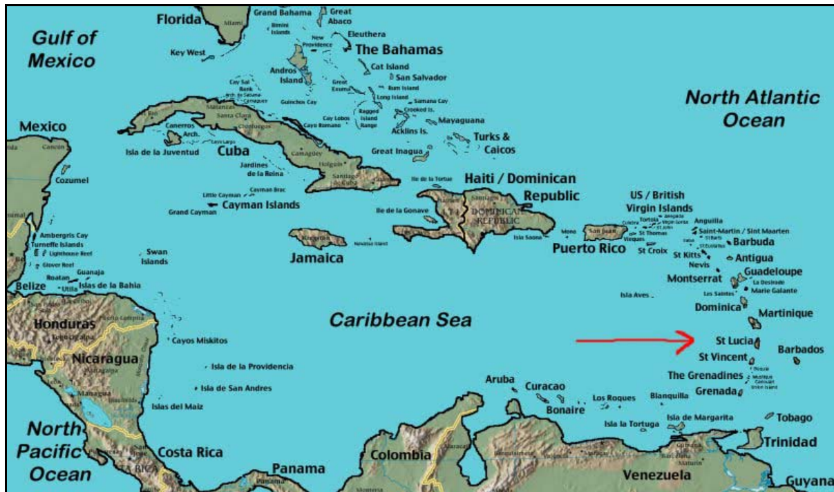
Figure 1. Location Map of Saint Lucia

Saint Lucia is a small island developing state (SIDS) located at 13°53'0"N, 60°58'0"W between Saint Vincent to the south and Martinique to the north in the Caribbean Sea bordering the Atlantic Ocean (refer to Figure 1). The island is approximately 616.4km 2 [238 square miles] in area with approximately 169,000 inhabitants 21 . The island exhibits an undulating mountainous terrain with a forested interior and is subject to a tropical climate. The major communities are located along the coast with the larger collection of population located in the north of the island.