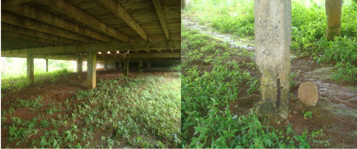
La Fargue Community Centre – conditions