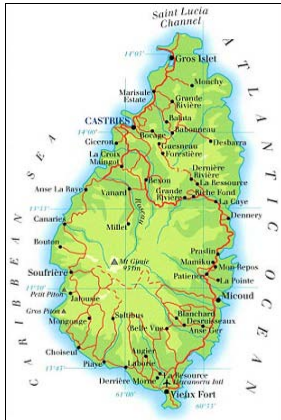
Figure 2. Relief Map of Saint Lucia

The northern, central and eastern parts of the island tend to display a softened, rounded topographic quality reflecting old geologic age, erosion and weathering. Expansive valley areas include such examples as Marquis, Choc, Cul de Sac, Roseau, Mabouya, Fond d’or and Troumassee Valleys, and are also generally where large agricultural production is undertaken. In the upper reaches the average