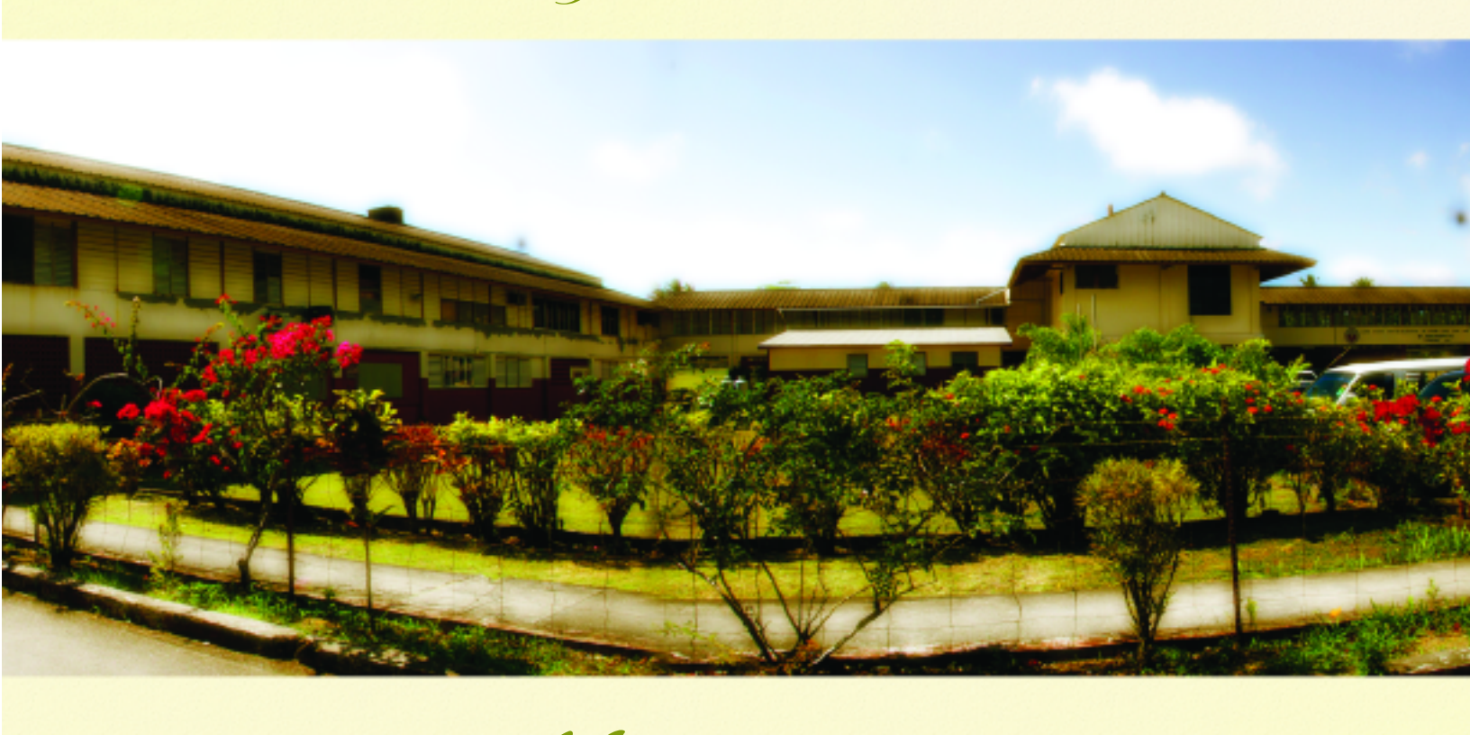
Building on a Legacy